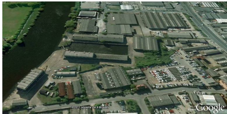
Proposed site -air view 2

The subject of the competition is the design of a regeneration proposal and the creation of a sustainable neighborhood within this area. This should provide accommodation for 12-15 families, plus infrastructure, office areas, leisure and recreation, as part of the regeneration program, which is based on a new paradigm for sustainable post-industrial regeneration.