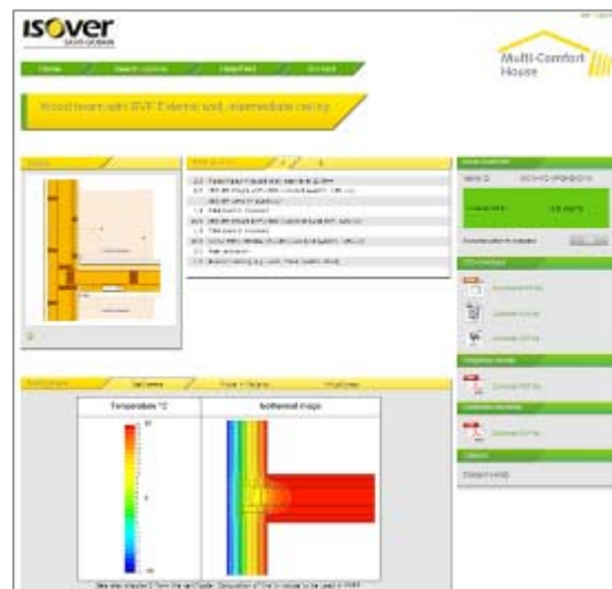
ISOVER Passive House Certified Details